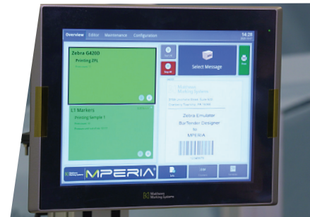
MPERIA Standard emulating third-party software