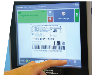
MPERIA Standard and L-Series marking