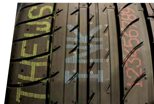
32V mark in pigmented ink on tire