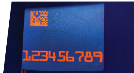
16V mark in fluorescent ink on lumber